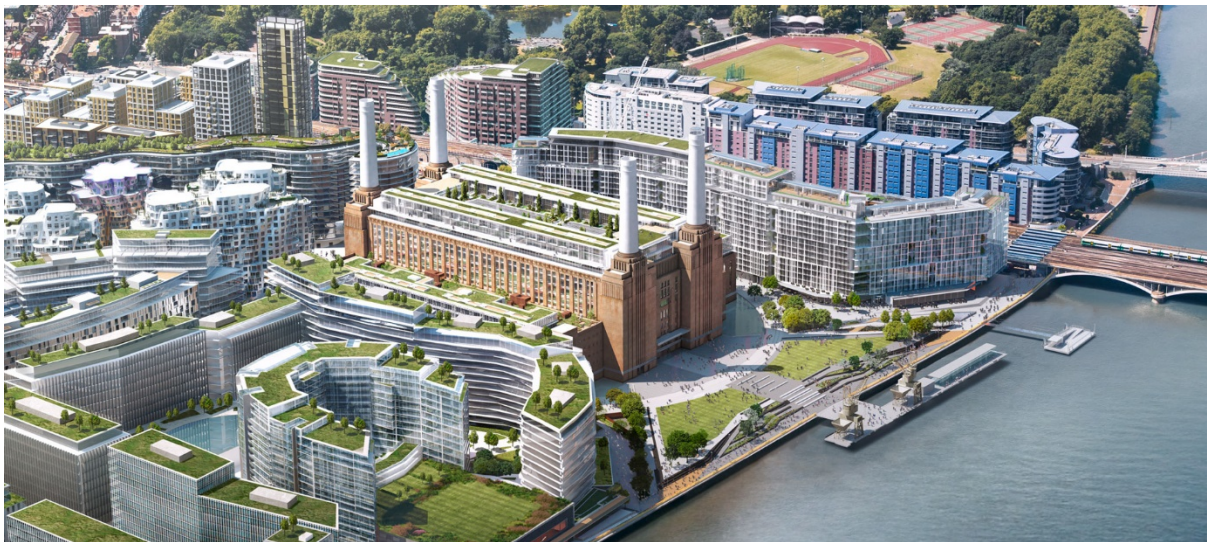
Figure 1: Successful conversion of Battersea Power Station, London provided 4,239 homes onto the 39 acre site, alongside shopping outlets and other attractions / amenities.

This substantially large plot of industrial land, located close to Higher Walton would accommodate the 1,800 houses planned for the Higher Walton Development and would likely accommodate 1,000's of other houses planned for other areas of Warrington's protected Green Belt areas.