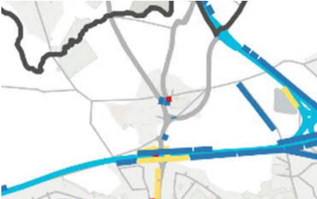
Scenario 2 – AM V/C Plot

Scenario 2 in the Transport Model Testing Appendix A shows that the junction of A573 Golborne Road and Myddleton Lane is above 100% V/C in both AM and PM time periods