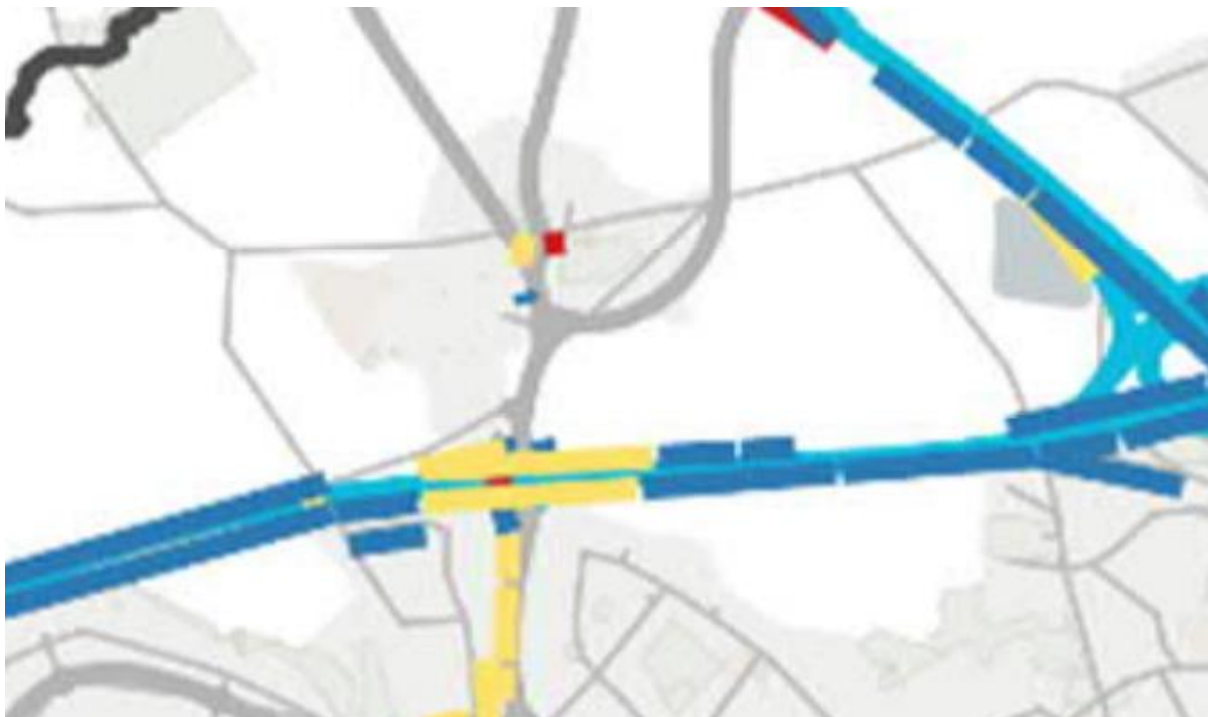
Scenario 2 PM V/C Plot