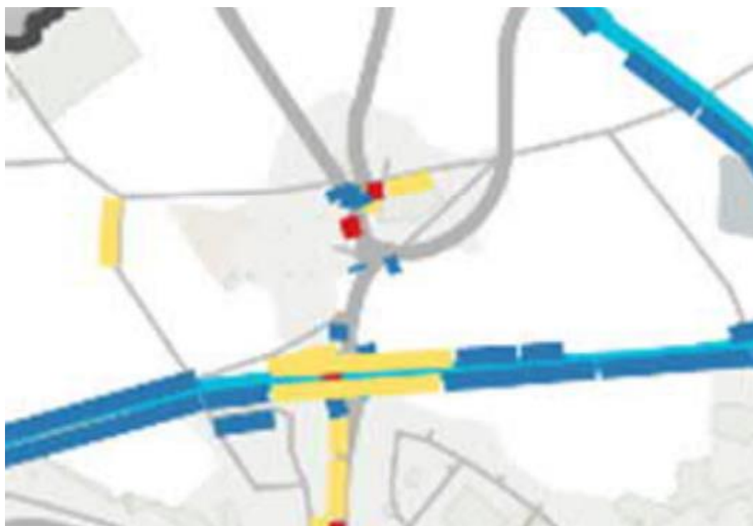
Scenario 1 V/C Plot – PM

If this development is not delivered, Scenario 1 would be in effect in this area, and the junction at A49 Newton Road and A572 Winwick Link Road is additionally shown as >100% V/C in PM.