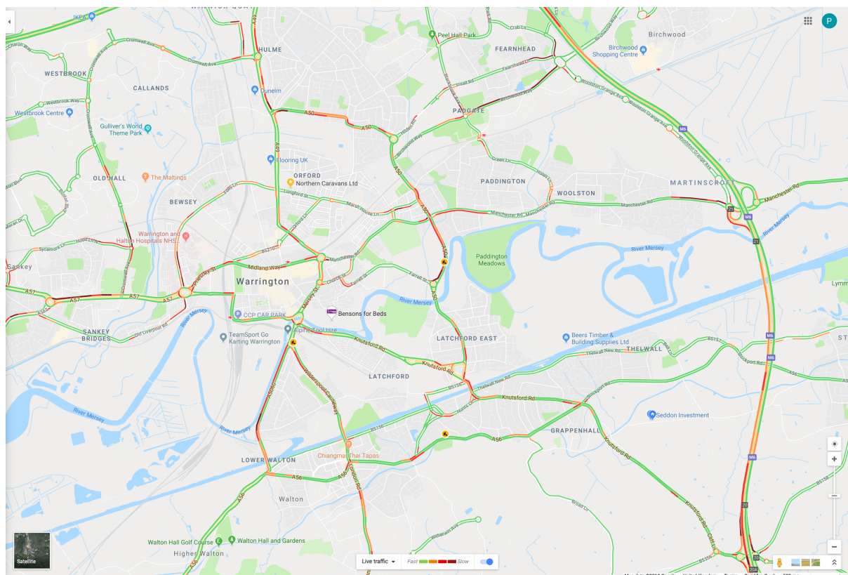
Typical daily traffic congestion on the Warrington Area road network