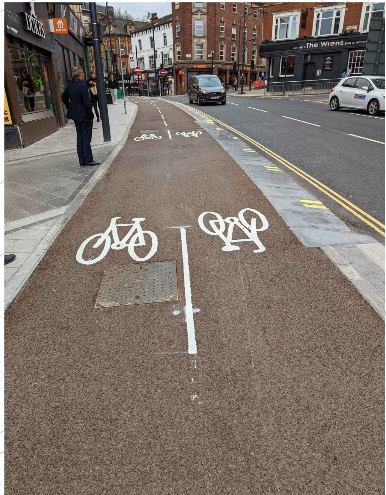
Example of dutch entrance kerb detail at Bridge Ave