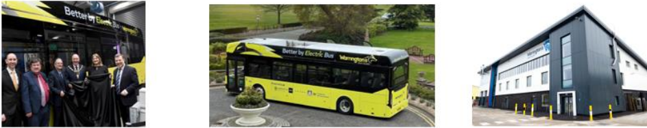
Town Deal Board - 18 October 2024